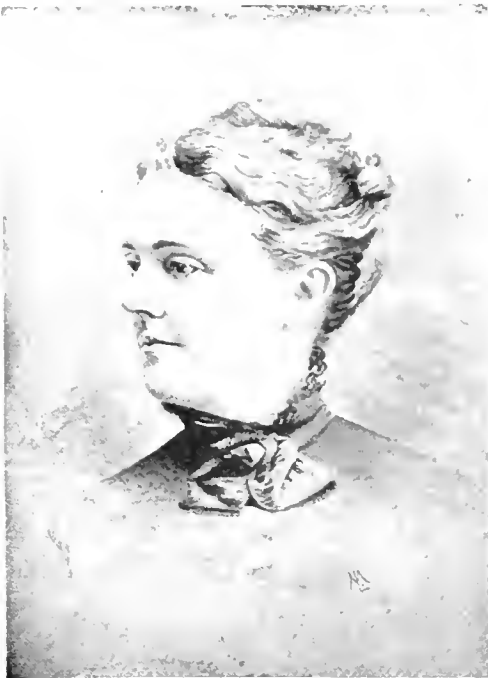
SARAH ORNE JEWETT.